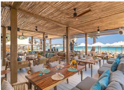
Catch Beach Club

Open daily from 5.30pm until midnight (last orders at 10.30pm).