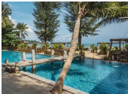
The Lazy Coconut