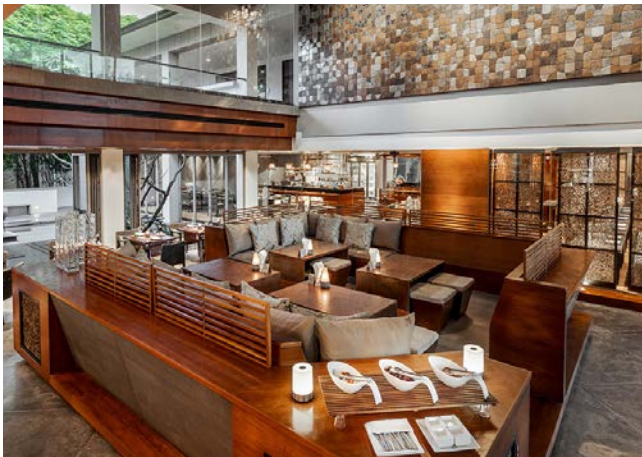
Oriental Spoon Restaurant

Open daily from 5:30pm until midnight (last orders 11pm).