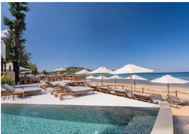
Catch Beach Club

From the breathtaking beauty of Phang Nga Bay's karst rock formations and emerald waters, to the crystal-clear waters around Koh Racha or Koh Phi Phi and more; perfect for snorkelling, scuba diving or kayaking adventures.