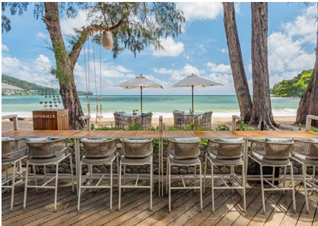
Shimmer Beachfront Restaurant

Available daily from 8am until 11pm (last orders 10pm).