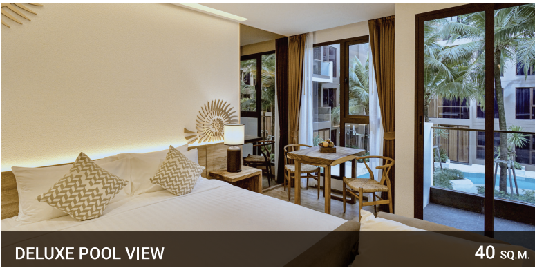
DELUXE POOL VIEW 40 SQ.M.