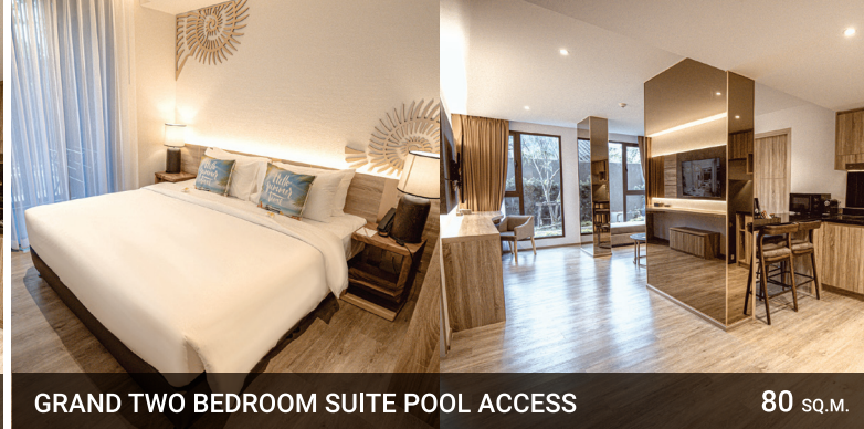
GRAND TWO BEDROOM SUITE POOL ACCESS 80 SQ.M.

ALL ROOMS FEATURE : SMART TV, SOFA BED, IN-ROOM SAFE BOX, BATHTUB & RAIN SHOWER, DIGITAL SCALE, PRIVATE BALCONY