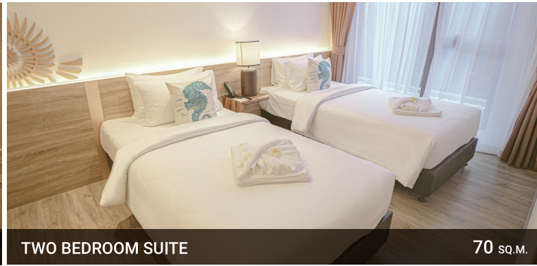
TWO BEDROOM SUITE 70 SQ.M.