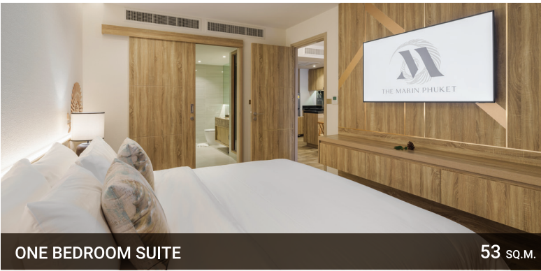
ONE BEDROOM SUITE 53 SQ.M.