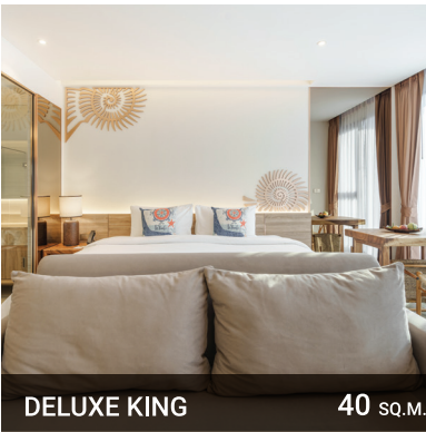
DELUXE KING 40 SQ.M.