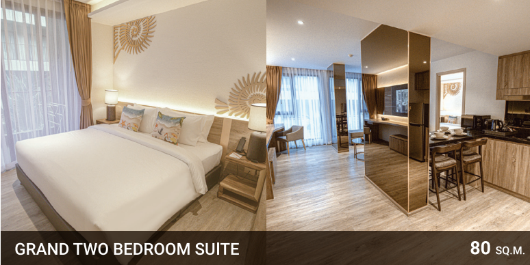
GRAND TWO BEDROOM SUITE 80 SQ.M.