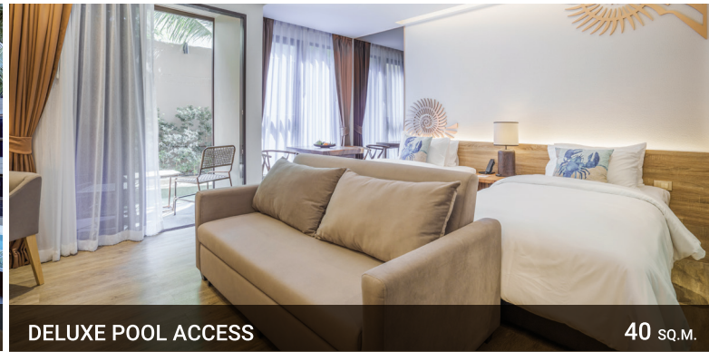
DELUXE POOL ACCESS 40 SQ.M.