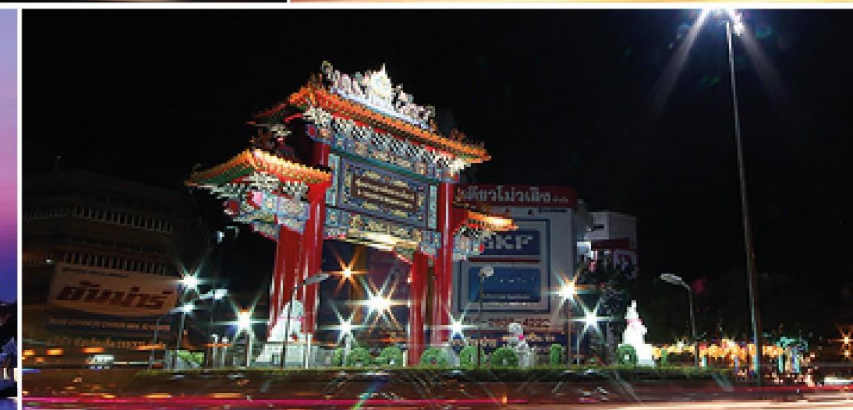
History & Culture : Local temples and shrines, original Chinese shophouses. Electric markets. And centuries old Hok-kien architecture speak to the district rich cultural roots.