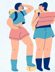
Nature Trails Hiking