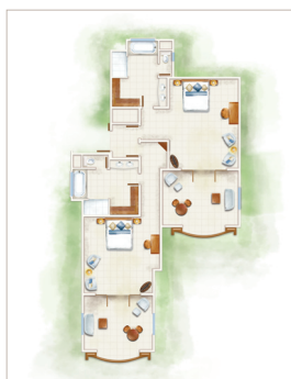
2-bedroom family suite / 2-bedroom Family Suite Beachfront