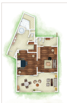
Senior Suite Beachfront