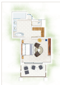
Paradis Bay View