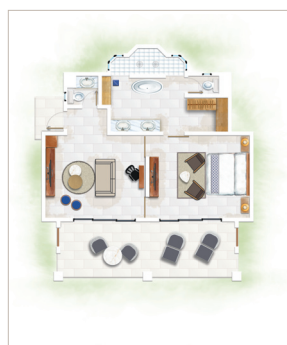
Paradis Suite Beachfront