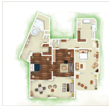
2-bedroom Senior Family Suite Beachfront