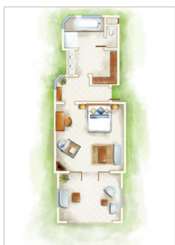
Junior Suite / Junior Suite Beachfront