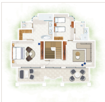
Paradis Luxury Family Suite Beachfront