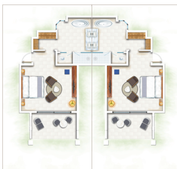
2-bedroom Paradis Family Suite Beachfront (interleading)