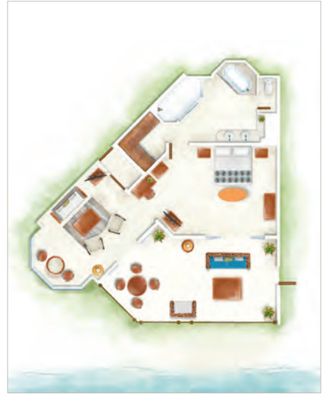
Senior Suite Beachfront / Senior Zen Suite Beachfront