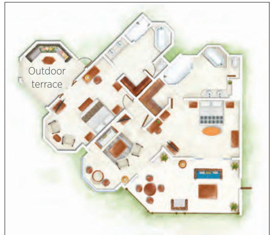
2-Bedroom Senior Family Suite Beachfront