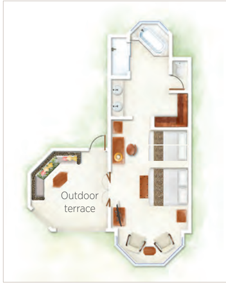
Junior Suite (2 adults + 2 children) / Junior Suite Beachfront (2 adults + 2 children) / Zen Suite / Zen Suite Beachfront