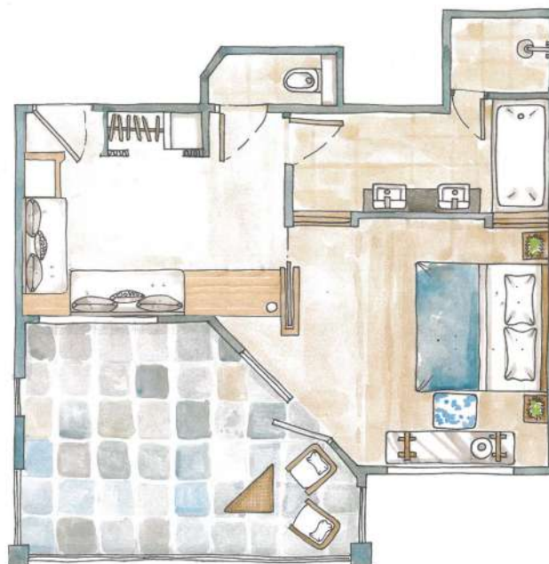
FAMILY SUITE & COUPLE JUNIOR SUITE