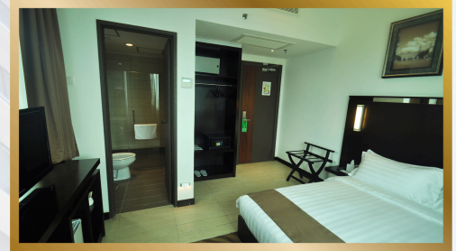
Deluxe Triple 01 Queen + 01 Single Bed Area 27 sqm