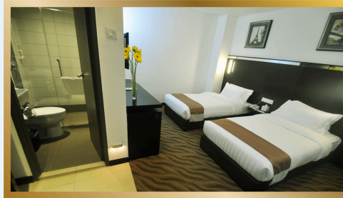
Standard Twin (No Window) 02 Single Bed Area 18 sqm