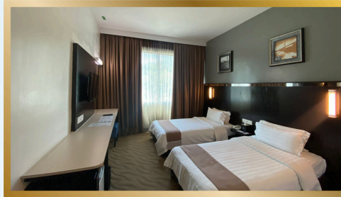
Deluxe Twin 02 Single Bed Area 22 sqm