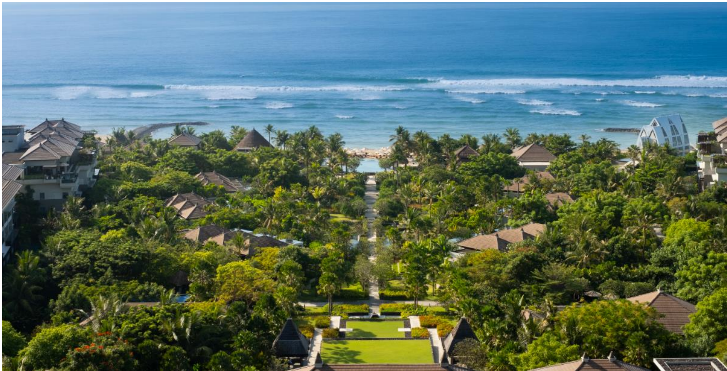
RESORT OVERVIEW 360°