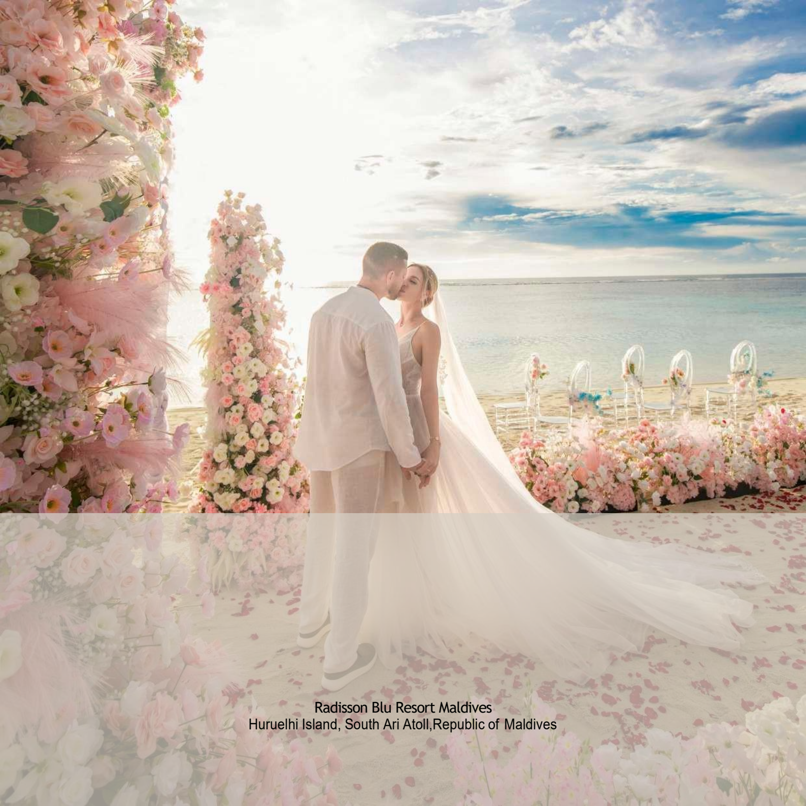
Radisson Blu Resort Maldives Huruelhi Island, South Ari Atoll, Republic of Maldives