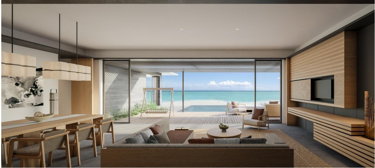
Photo: New Boduge Residence Living Room and Dining Room

The Boduge Residence would be ideal for larger families or groups travelling together, as it connects seamlessly to a neighboring villa, creating a three-bedroom sanctuary of refined island living.