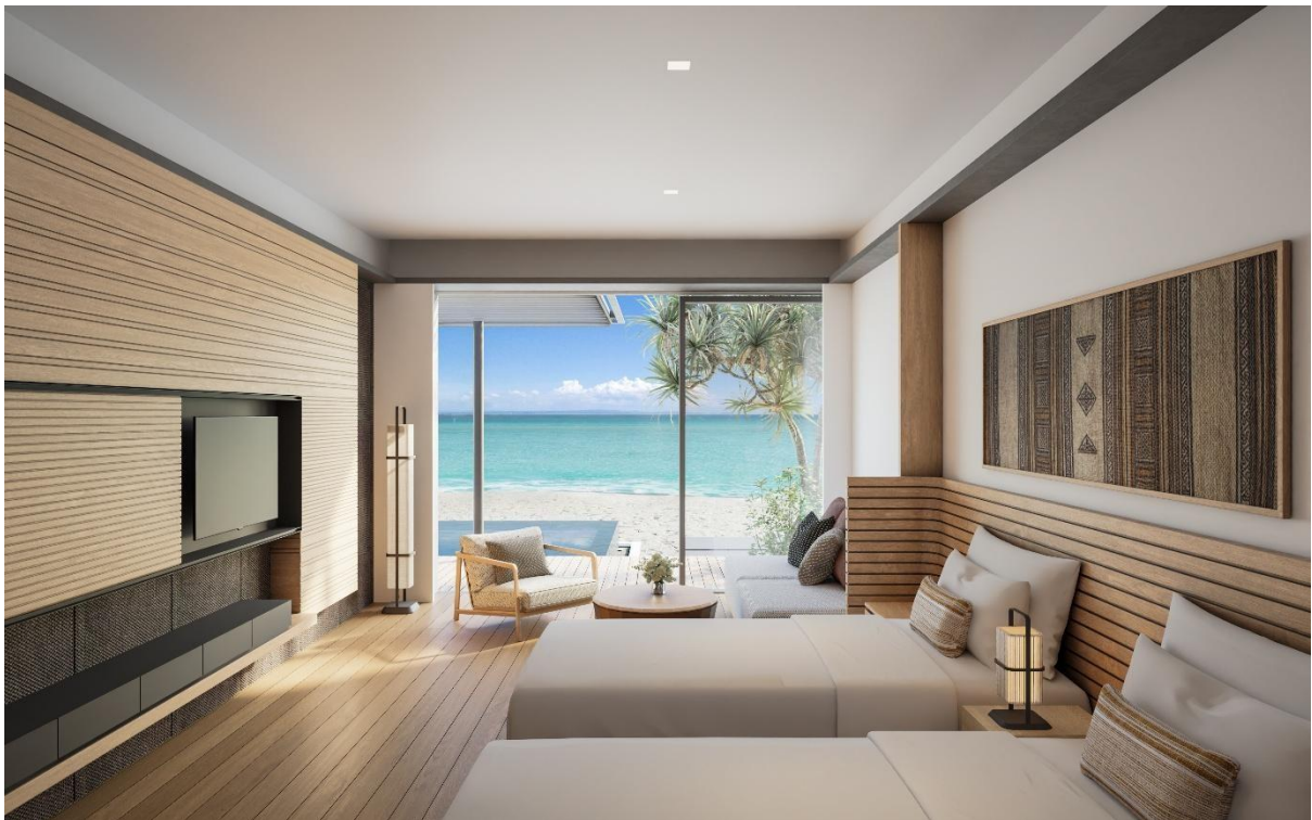
Photo: New Two-Bedroom Villas Room View with Twin Beds

Set along the powder-soft shores of the all-natural island, the expansive Two-Bedroom Beach Pool Villa spans 265 square meters of seamless indoor-outdoor living space, providing an ideal retreat for families or group of friends travelling together.