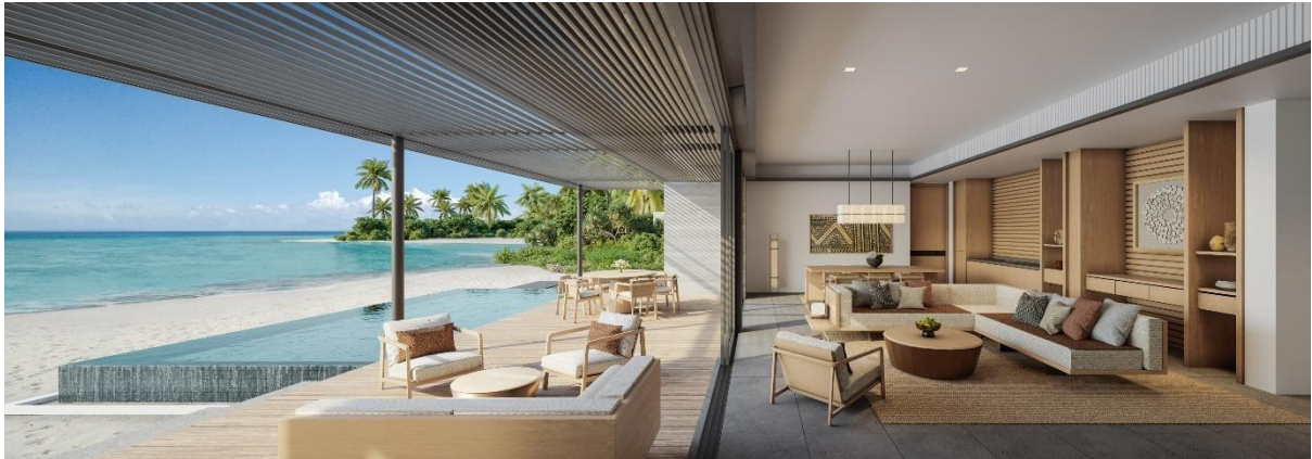
New Two-Bedroom Villas Living Room and Pool Deck

Set along the powder-soft shores of the all-natural island, the expansive Two-Bedroom Beach Pool Villa spans 265 square meters of seamless indoor-outdoor living space, providing an ideal retreat for families or group of friends travelling together.