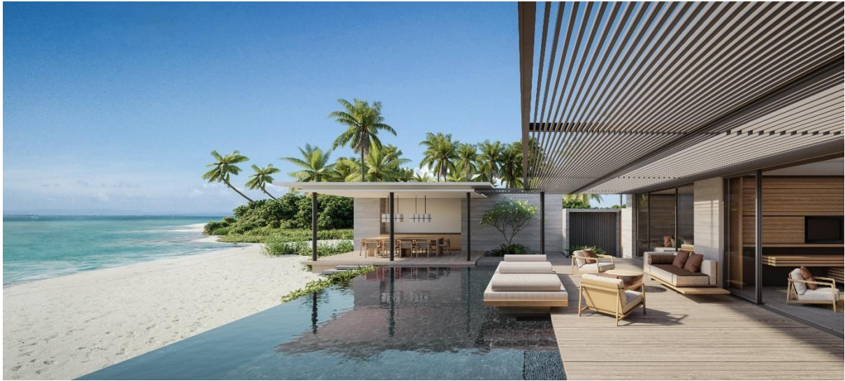
Photo: New Boduge Residence Outdoor Dining Area, Private Pool and Deck

For those seeking even greater luxury of space and privacy, the two-bedroom Boduge Residence is a magnificent 395-square-meter retreat nestled along a pristine stretch of beach with ocean views.