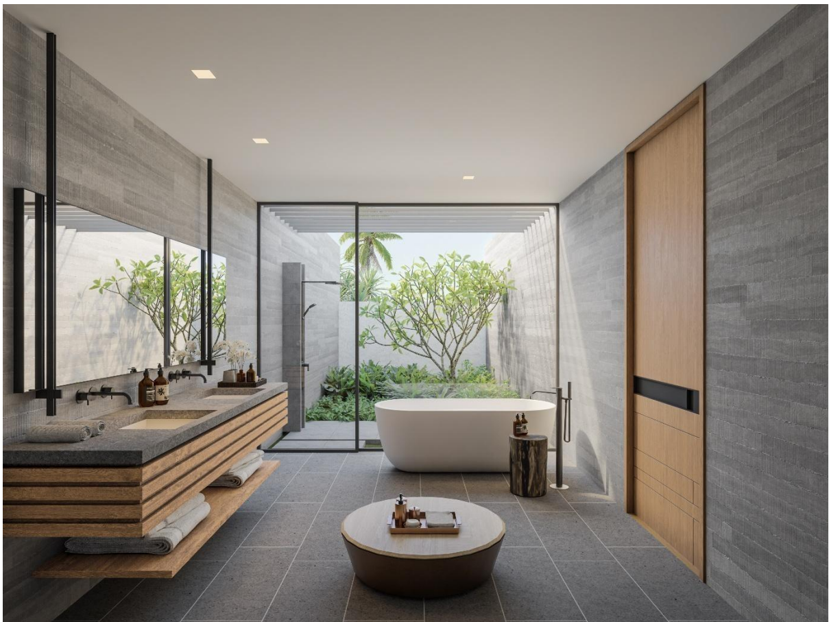
Photo: New Villas Enclosed Bathrooms

The Boduge Residence would be ideal for larger families or groups travelling together, as it connects seamlessly to a neighboring villa, creating a three-bedroom sanctuary of refined island living.