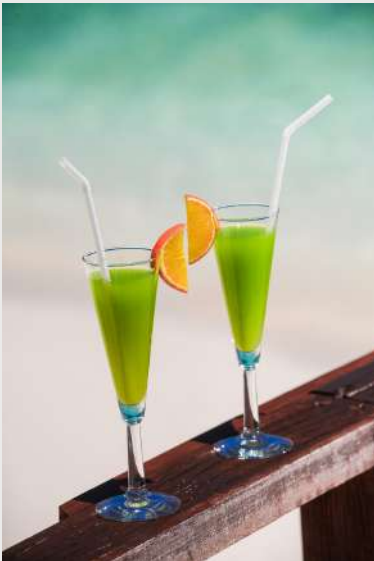
Relaxation at hand.

Kick back and relax at the Sand Bar, sipping sunset cocktails while drinking in the mesmerizing views.