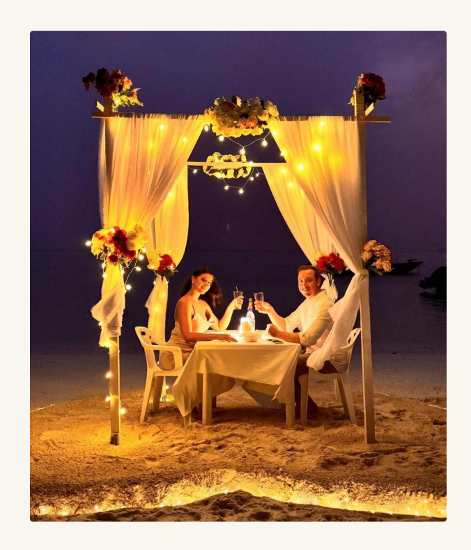
Romantic Beach Sunset Dinner