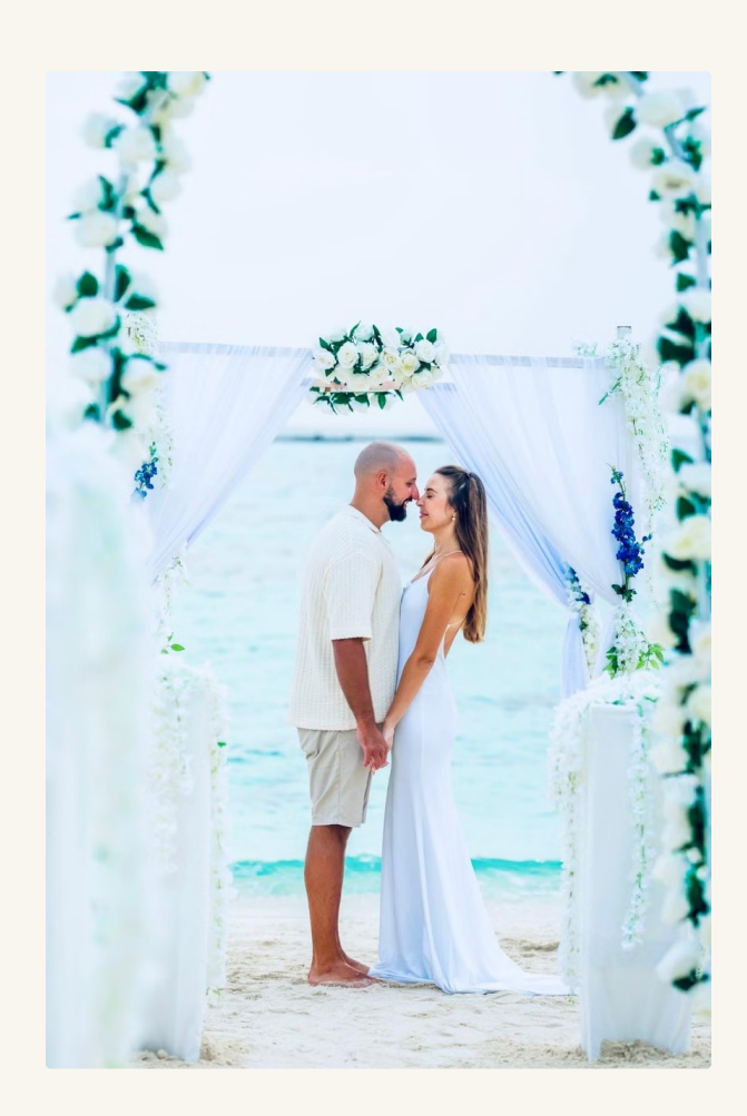
Wedding & Honeymoon

Please discuss with our manager for price and details