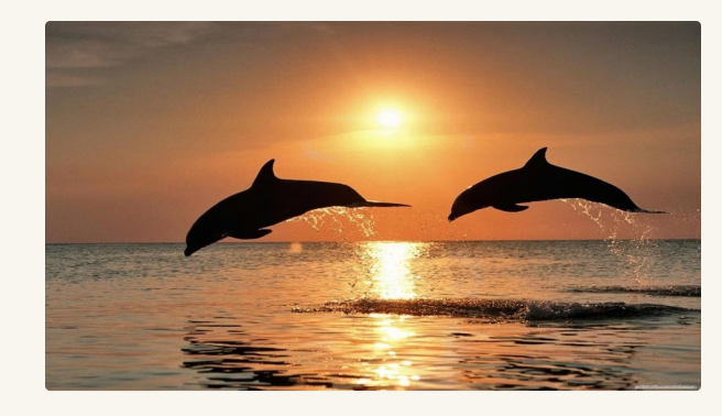
Sunset Cruise with Dolphins