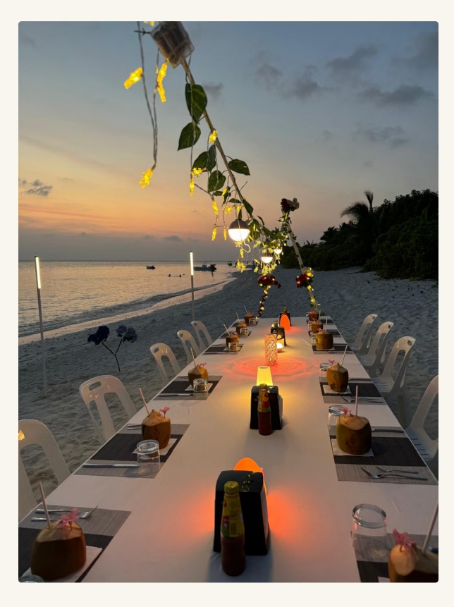
Group Dinner on the beach

Includes decorations set up, lights and music and food as per the customer wants