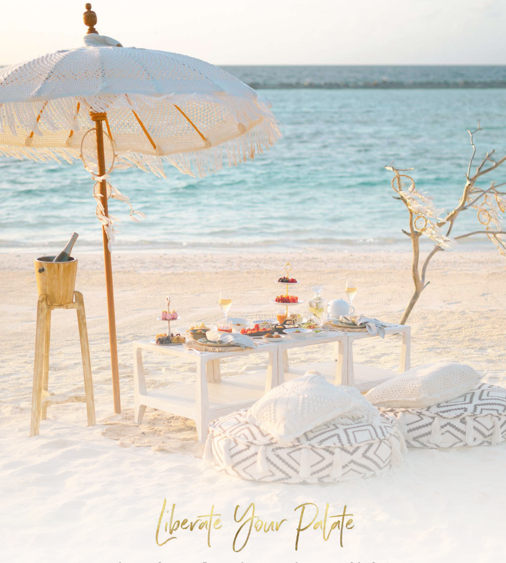
Feast on a bounty of gourmet flavours that capture the essence of the festive season. Raise a toast to the holiday spirit with handcrafted cocktails, and bask in the warmth of joy with your loved ones.