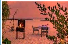
PRIVATE BEACH BBQ