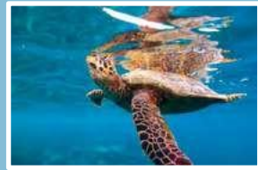
TRIP FOR DIVERS