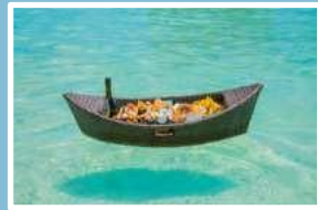
FLOATING DHONI BREAKFAST