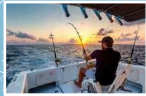
BIG GAME FISHING