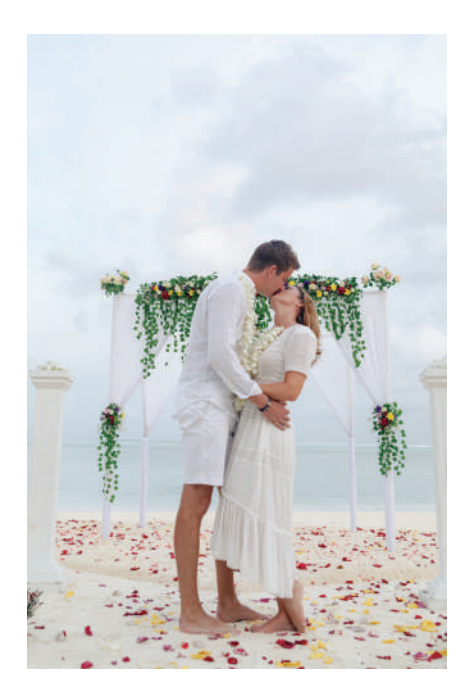
COCOON MOMENTS STAY IN TOUCH