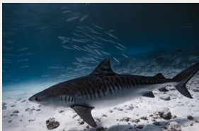
Tiger Shark Dive

A once-in-a-lifetime swim alongside the gentle giant of the ocean.