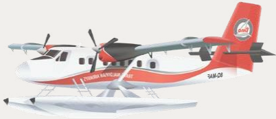
Located in the Huvadhoo Atoll, the only region of the Maldives free from boat traffics, seaplanes and cityscapes.

Muraka, our Marine Biology and Sustainability Hub, is a living laboratory where conservation, education, and ocean discovery unite to protect reefs and inspire mindful island stewardship under the guidance of our resident Marine Biologist.