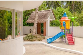
Faru Kids Club

Timing: 24/7 Cardio and weights available