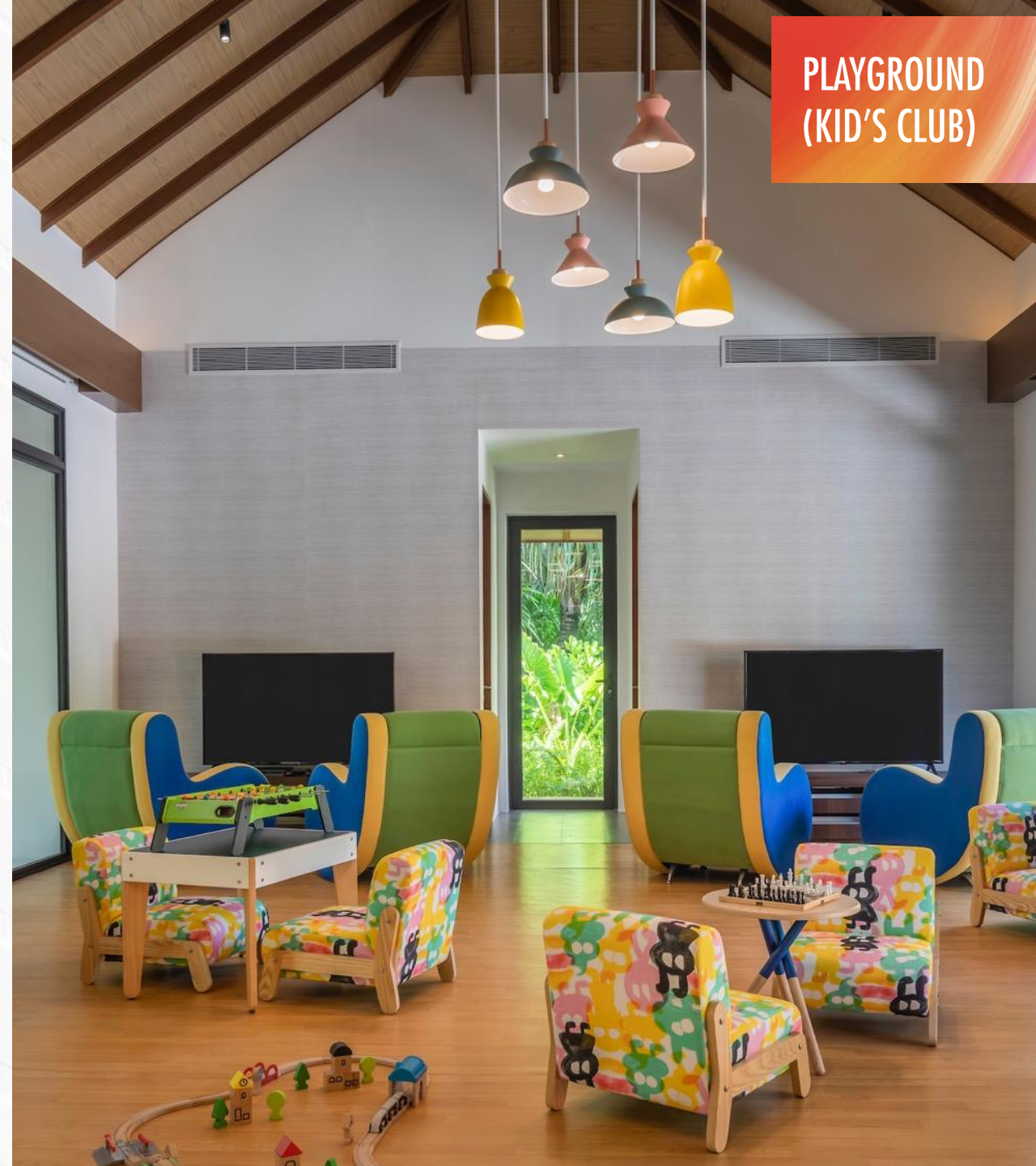
PLAYGROUND (KID'S CLUB)