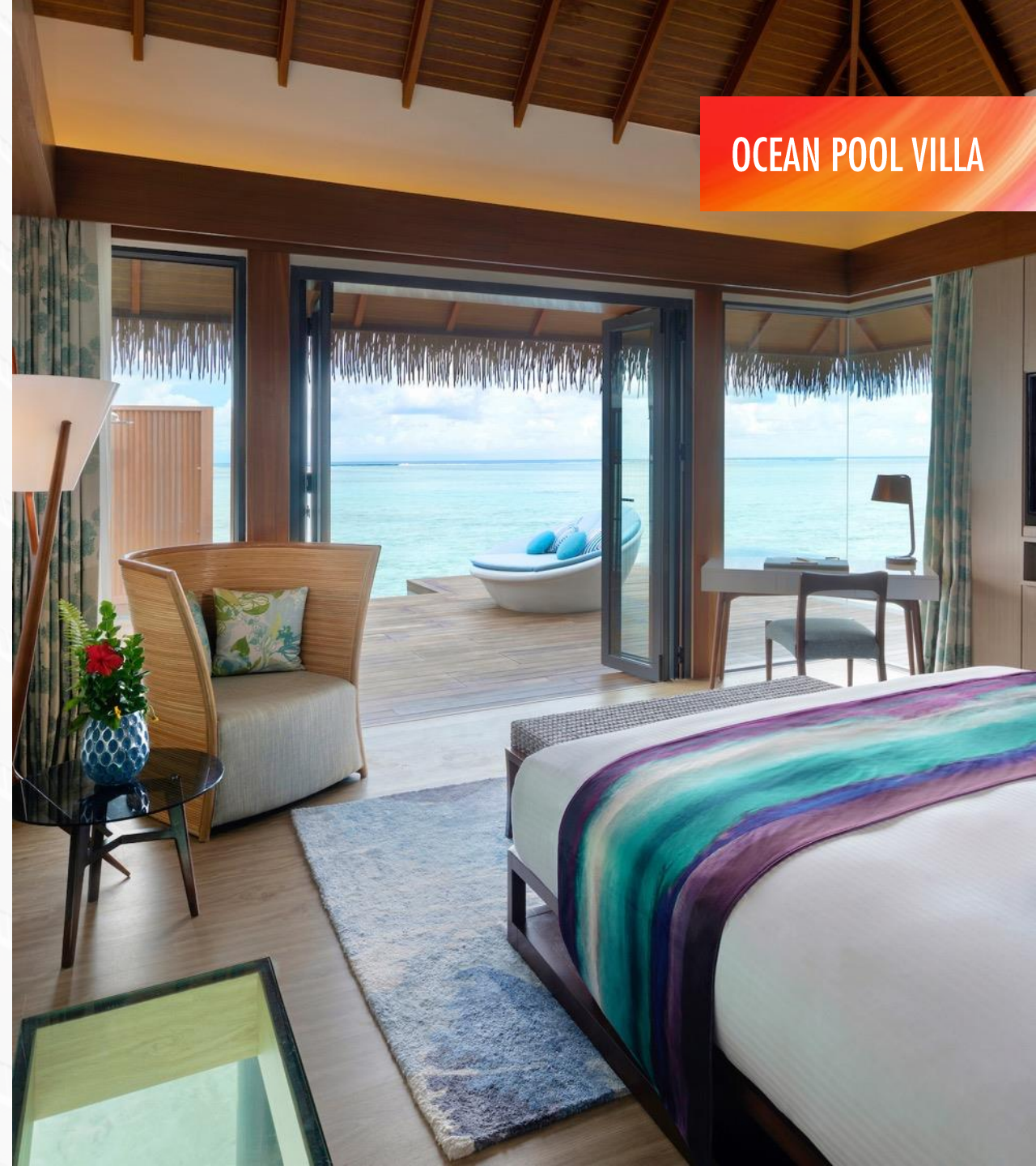
OCEAN POOL VILLA