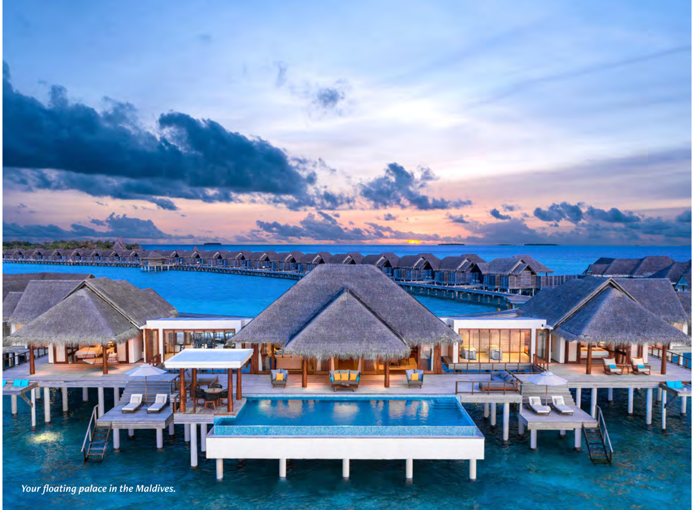
Your floating palace in the Maldives.