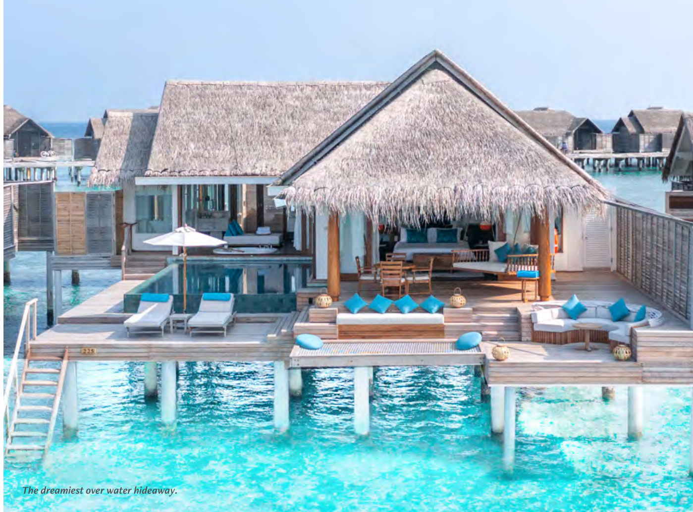
The dreamiest over water hideaway.