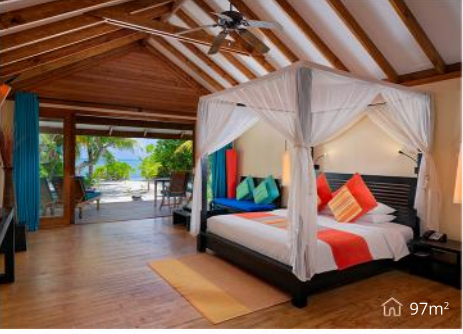
🎧 120 villas ڴ Sandy Beach 谸 1 - 4 pax