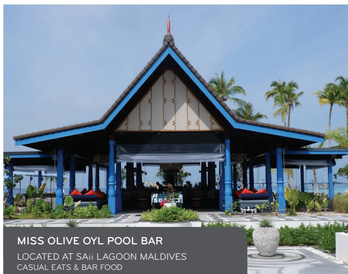
MISS OLIVE OYL POOL BAR

LOCATED AT SAIi BEACH CLUB ASIAN FLAVOURS