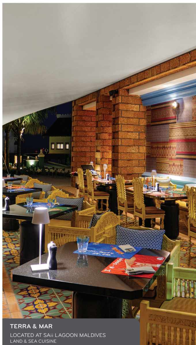
TERRA & MAR

LOCATED AT SAIi LAGOON MALDIVES CASUAL EATS & BAR FOOD