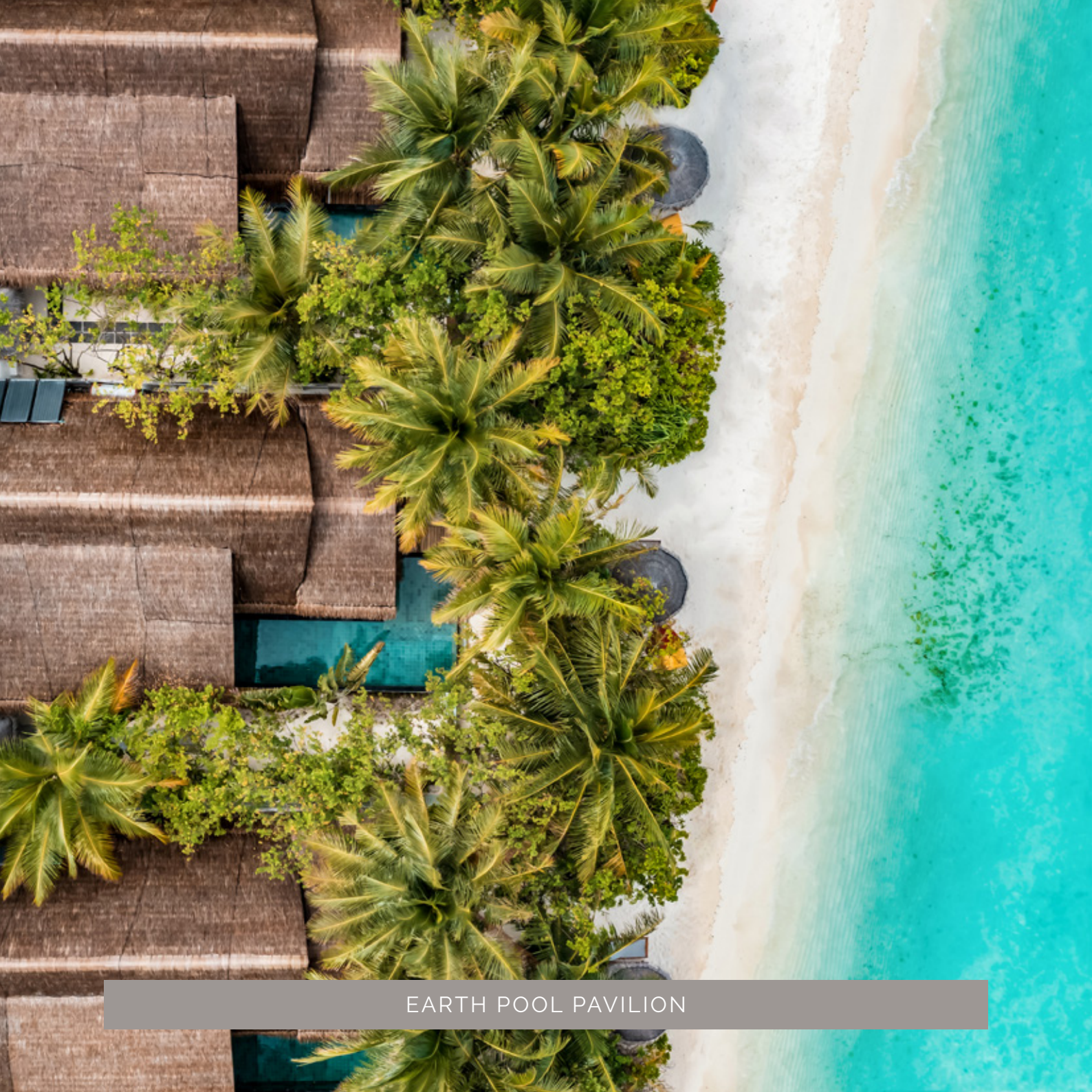
EARTH POOL PAVILION