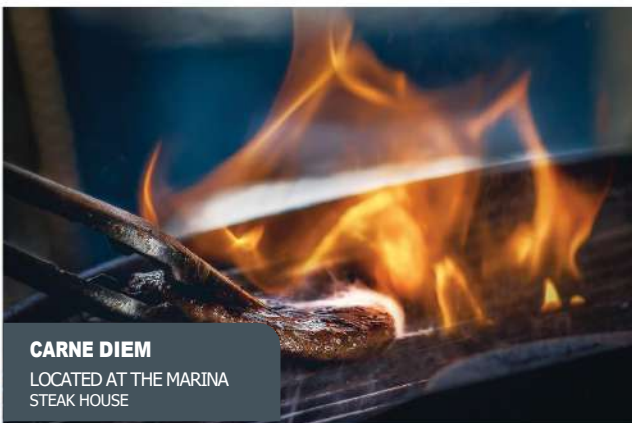
CARNE DIEM LOCATED AT THE MARINA STEAK HOUSE