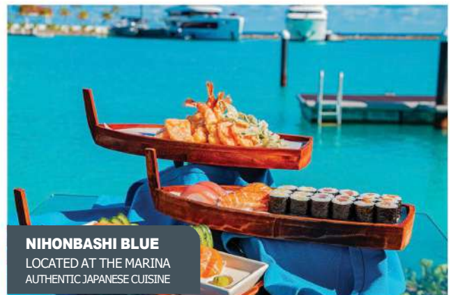
NIHONBASHI BLUE LOCATED AT THE MARINA AUTHENTIC JAPANESE CUISINE