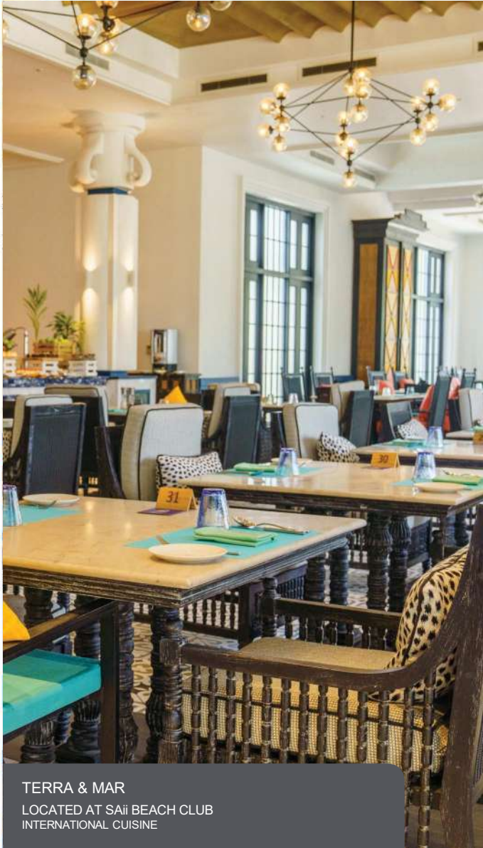
TERRA & MAR LOCATED AT SAii BEACH CLUB INTERNATIONAL CUISINE