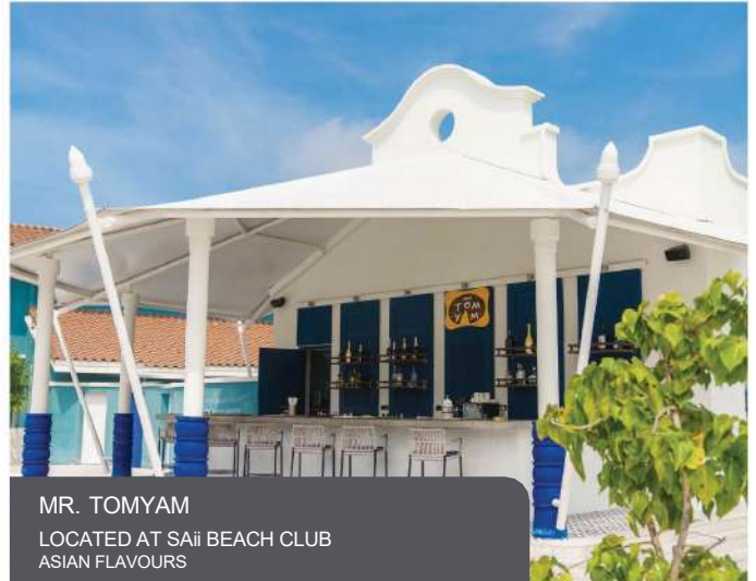
MR. TOMYAM LOCATED AT SAii BEACH CLUB ASIAN FLAVOURS