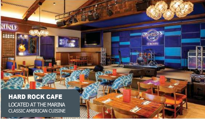
HARD ROCK CAFE LOCATED AT THE MARINA CLASSIC AMERICAN CUISINE