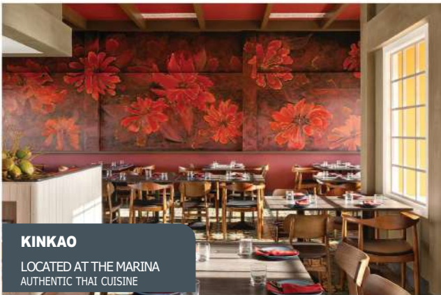
KINKAO LOCATED AT THE MARINA AUTHENTIC THAI CUISINE