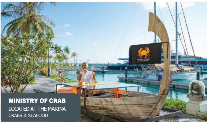
MINISTRY OF CRAB LOCATED AT THE MARINA CRABS & SEAFOOD