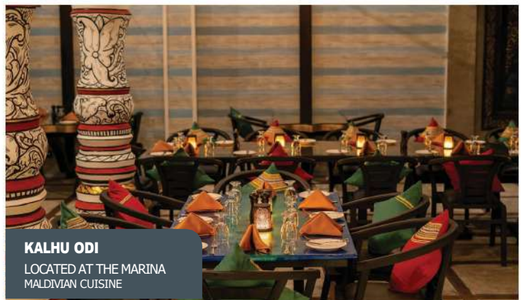
KALHU ODI LOCATED AT THE MARINA MALDIVIAN CUISINE