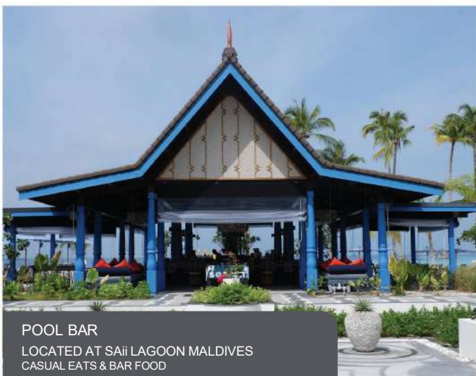
POOL BAR LOCATED AT SAii LAGOON MALDIVES CASUAL EATS & BAR FOOD