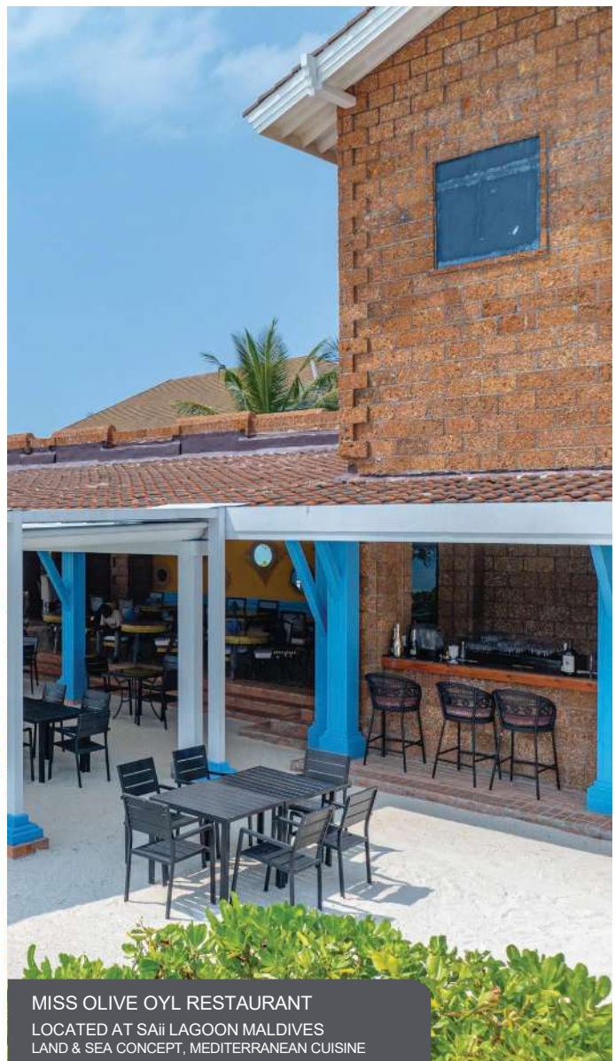
MISS OLIVE OYL RESTAURANT LOCATED AT SAii LAGOON MALDIVES LAND & SEA CONCEPT, MEDITERRANEAN CUISINE