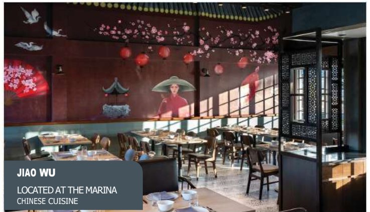
JIAO WU LOCATED AT THE MARINA CHINESE CUISINE