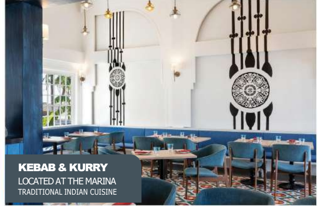
KEBAB & KURRY LOCATED AT THE MARINA TRADITIONAL INDIAN CUISINE