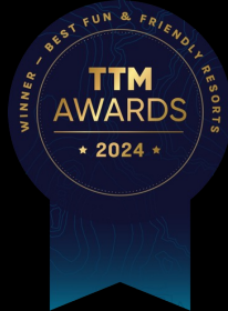
Best Fun & Friendly Resort TTM Awards