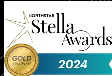
Best Overseas MICE Hotel Northstar Stella Awards