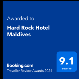
Traveller Review Award Booking.com