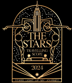
Best Overseas Hotel Travelling Scope China