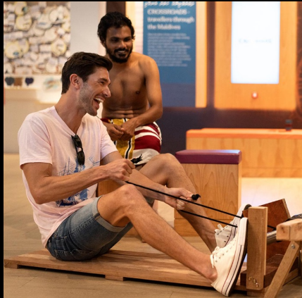
Maldives Discovery Centre

An unforgettable educational experience that works closely with the local community to promote the way of life and handicrafts of our remarkable island nation.