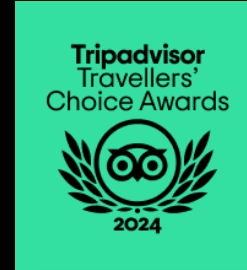
Travellers' Choice Award Tripadvisor