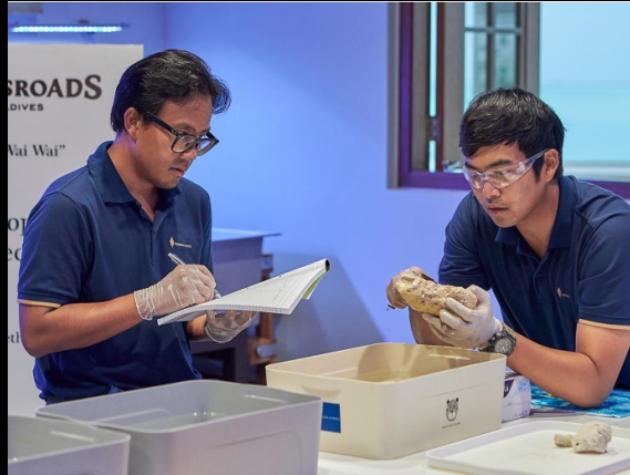
Marine Discovery Centre

An unforgettable educational experience that works closely with the local community to promote the way of life and handicrafts of our remarkable island nation.