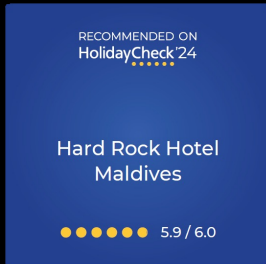
Recommodation HolidayCheck Germany