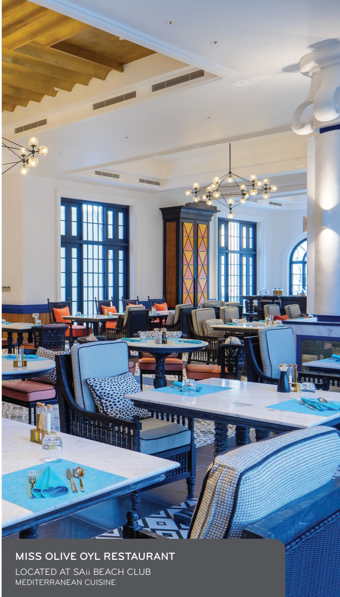
MISS OLIVE OYL RESTAURANT

LOCATED AT SAIi BEACH CLUB MEDITERRANEAN CUISINE