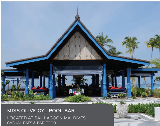
MISS OLIVE OYL POOL BAR

LOCATED AT SAIi BEACH CLUB ASIAN FLAVOURS