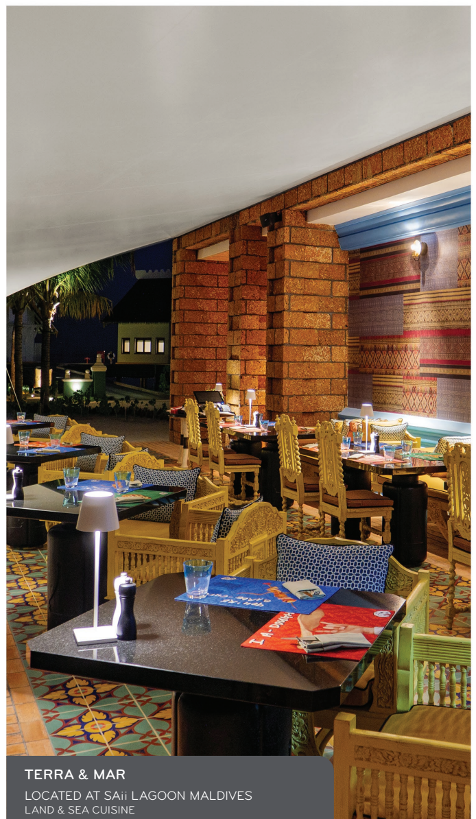
TERRA & MAR

LOCATED AT SAIi LAGOON MALDIVES CASUAL EATS & BAR FOOD