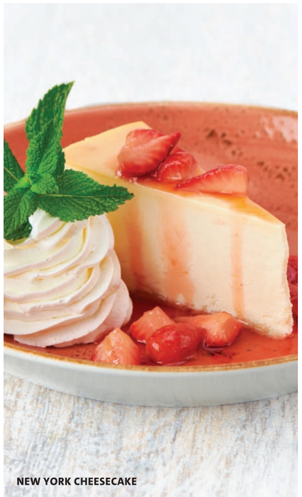
NEW YORK CHEESECAKE