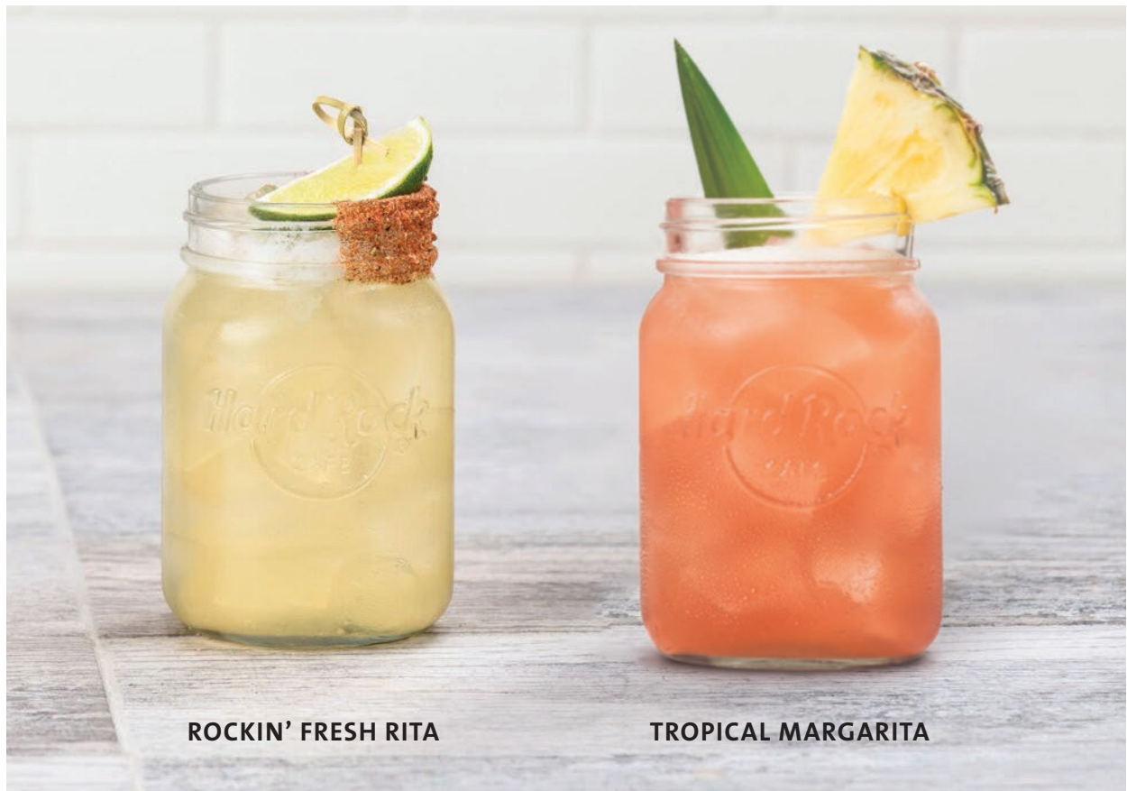
ROCKIN' FRESH RITA

Smirnoff Vodka, Bacardi Superior Rum, Beefeater Gin and Blue Curaçao with sweet & sour and topped with Red Bull®. US$ 10