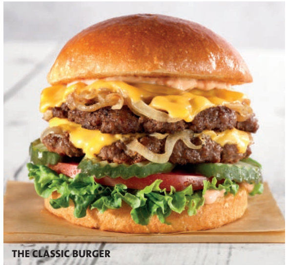
THE CLASSIC BURGER