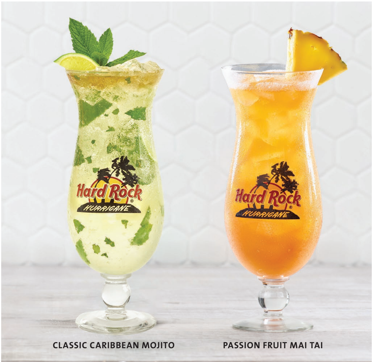
CLASSIC CARIBBEAN MOJITO