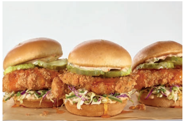
FRIED CHICKEN SLIDERS