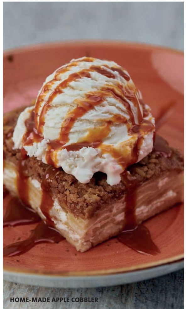
HOME-MADE APPLE COBBLER

Classic milkshake, your choice of Vanilla, Strawberry, or Chocolate, blended thick and finished with fresh whipped cream. $12