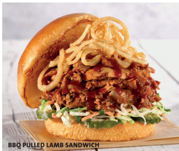
BBQ PULLED LAMB SANDWICH

Grilled fresh chicken with melted Monterey Jack cheese, smoked Turkey bacon, leaf lettuce and vine-ripened tomato, served on a fresh toasted bun with honey mustard sauce. $22