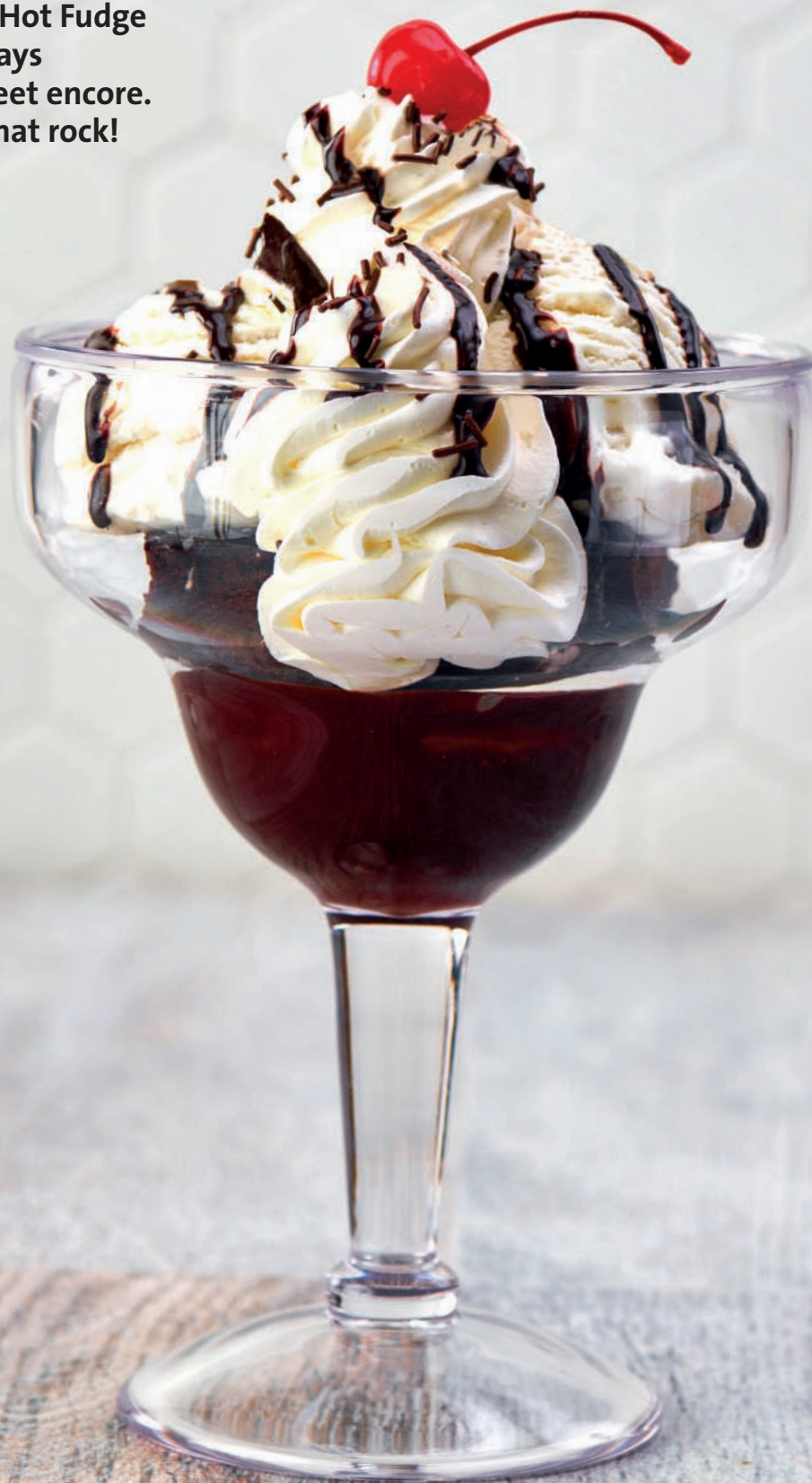
HOT FUDGE BROWNIE

From Milkshakes to Hot Fudge Brownies, nothing says rock n' roll like a sweet encore. Cheers to desserts that rock!