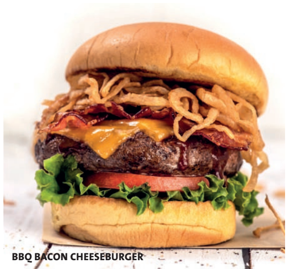
BBQ BACON CHEESEBURGER

Our signature steak burger topped with One Night in Bangkok Spicy Shrimp™ on a bed of spicy slaw.* $28