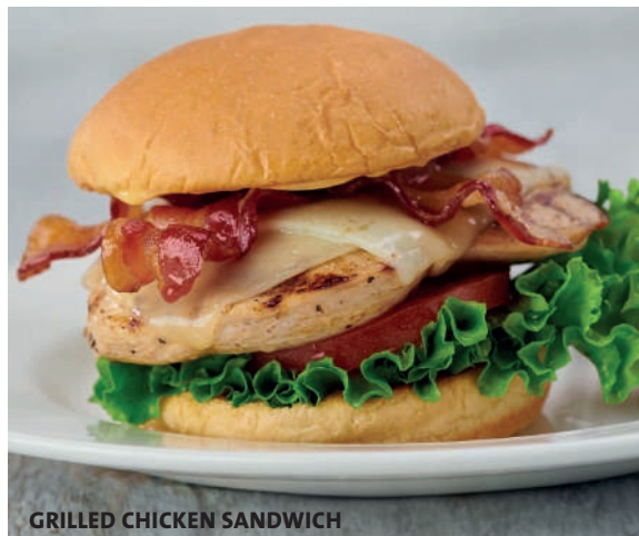
GRILLED CHICKEN SANDWICH