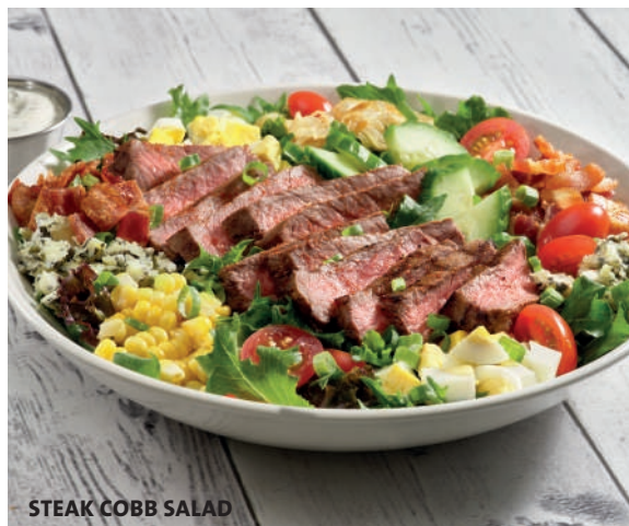
STEAK COBB SALAD

Grilled Steak $32 Grilled Shrimps $28 Grilled Salmon $40