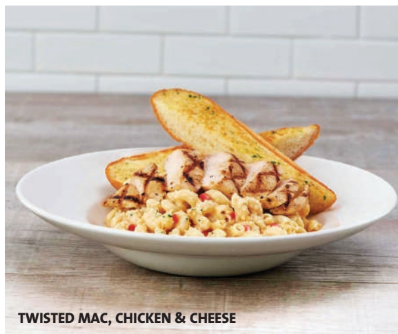
TWISTED MAC, CHICKEN & CHEESE

Crispy chicken tenders served with seasoned fries, honey mustard and our house-made barbecue sauce. $28