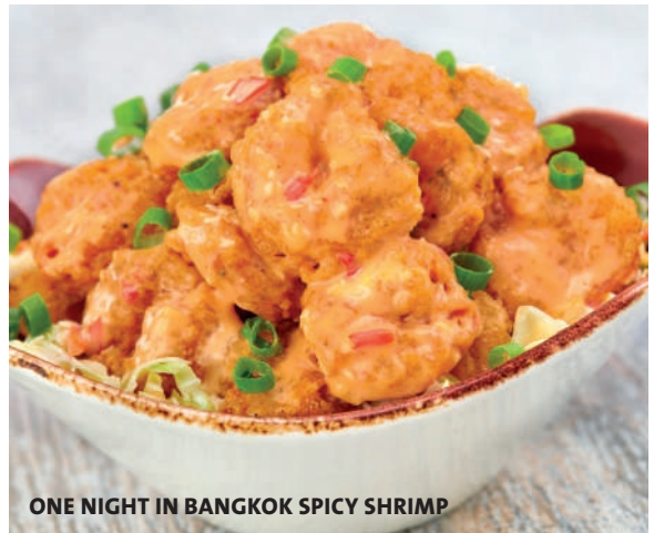
ONE NIGHT IN BANGKOK SPICY SHRIMP