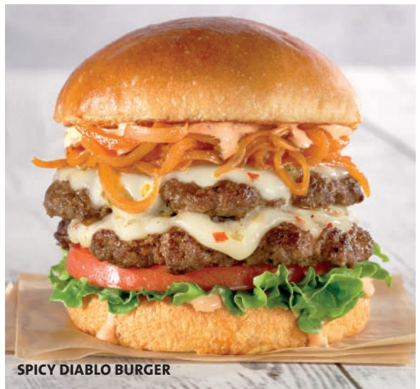
SPICY DIABLO BURGER