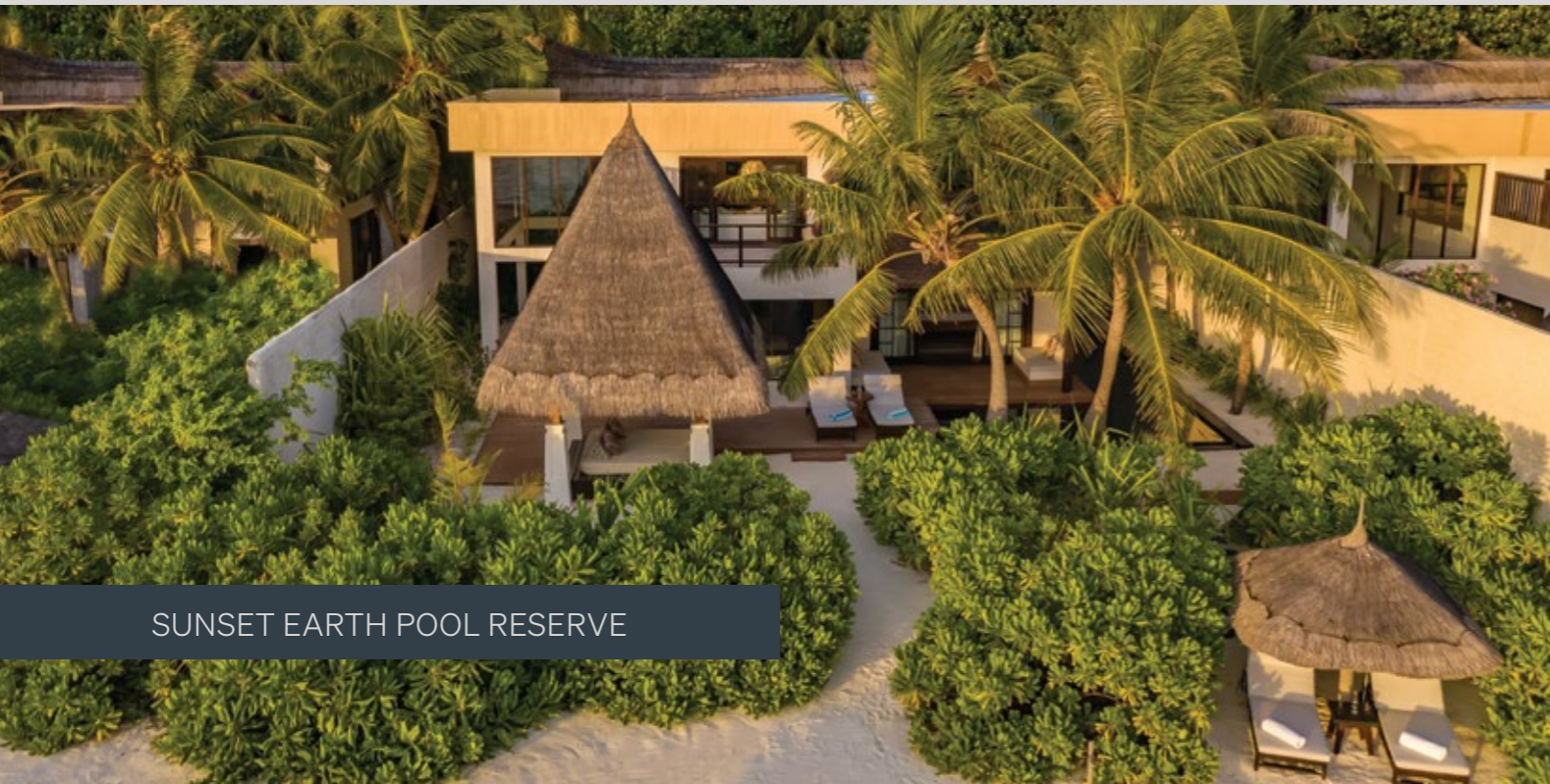
SUNSET EARTH POOL RESERVE