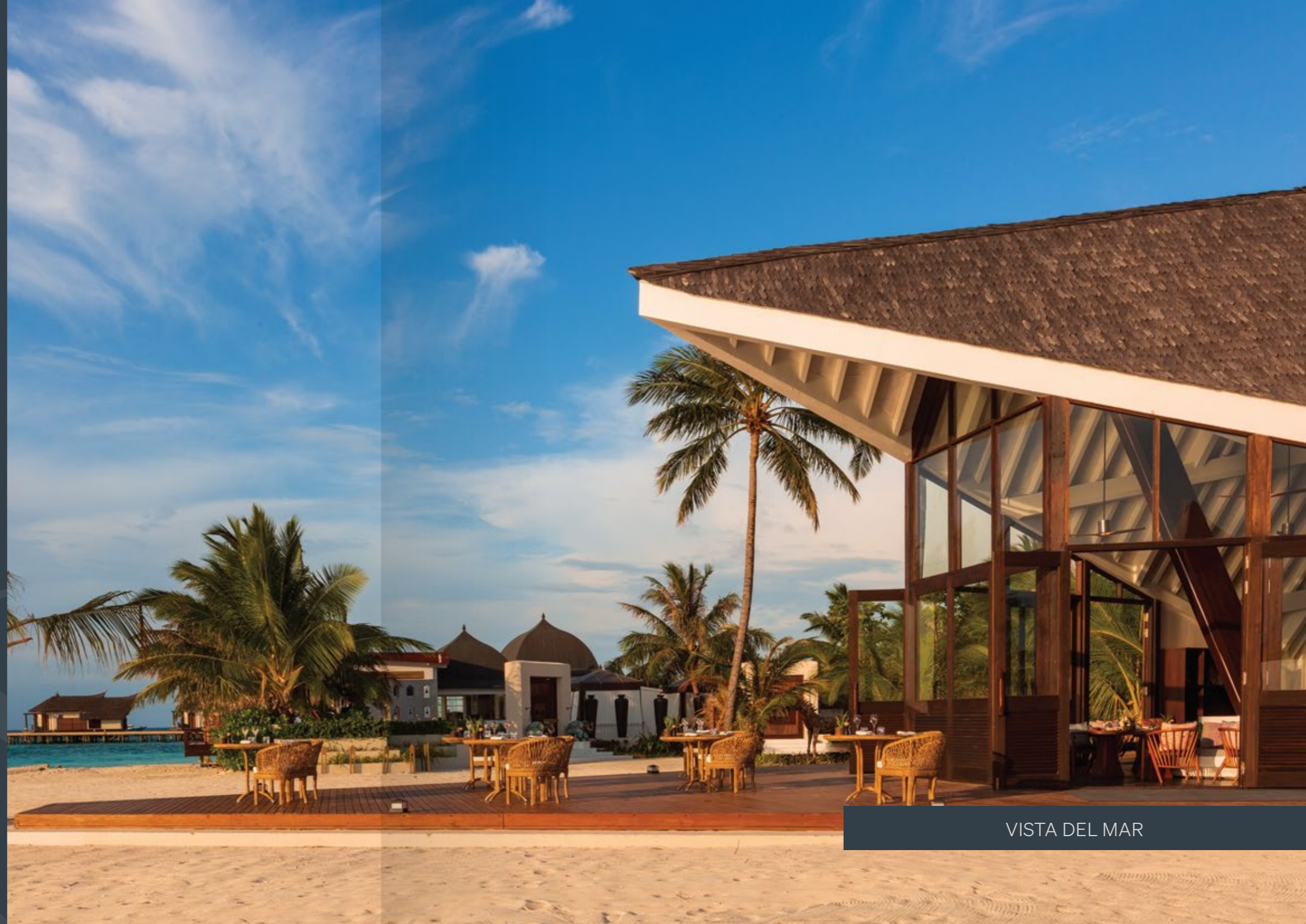
VISTA DEL MAR

Our passionate team of chefs source the freshest ingredients and collect herbs from the Chef's Garden on the island to create dishes worthy of paradise.