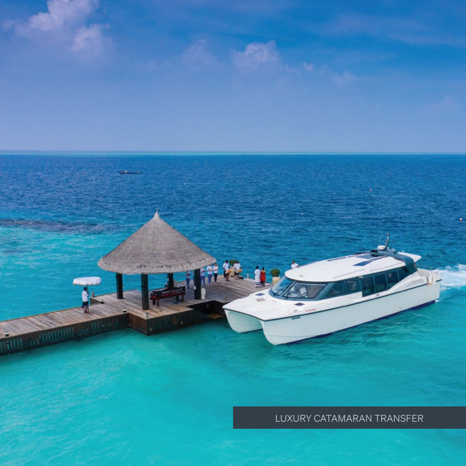
LUXURY CATAMARAN TRANSFER