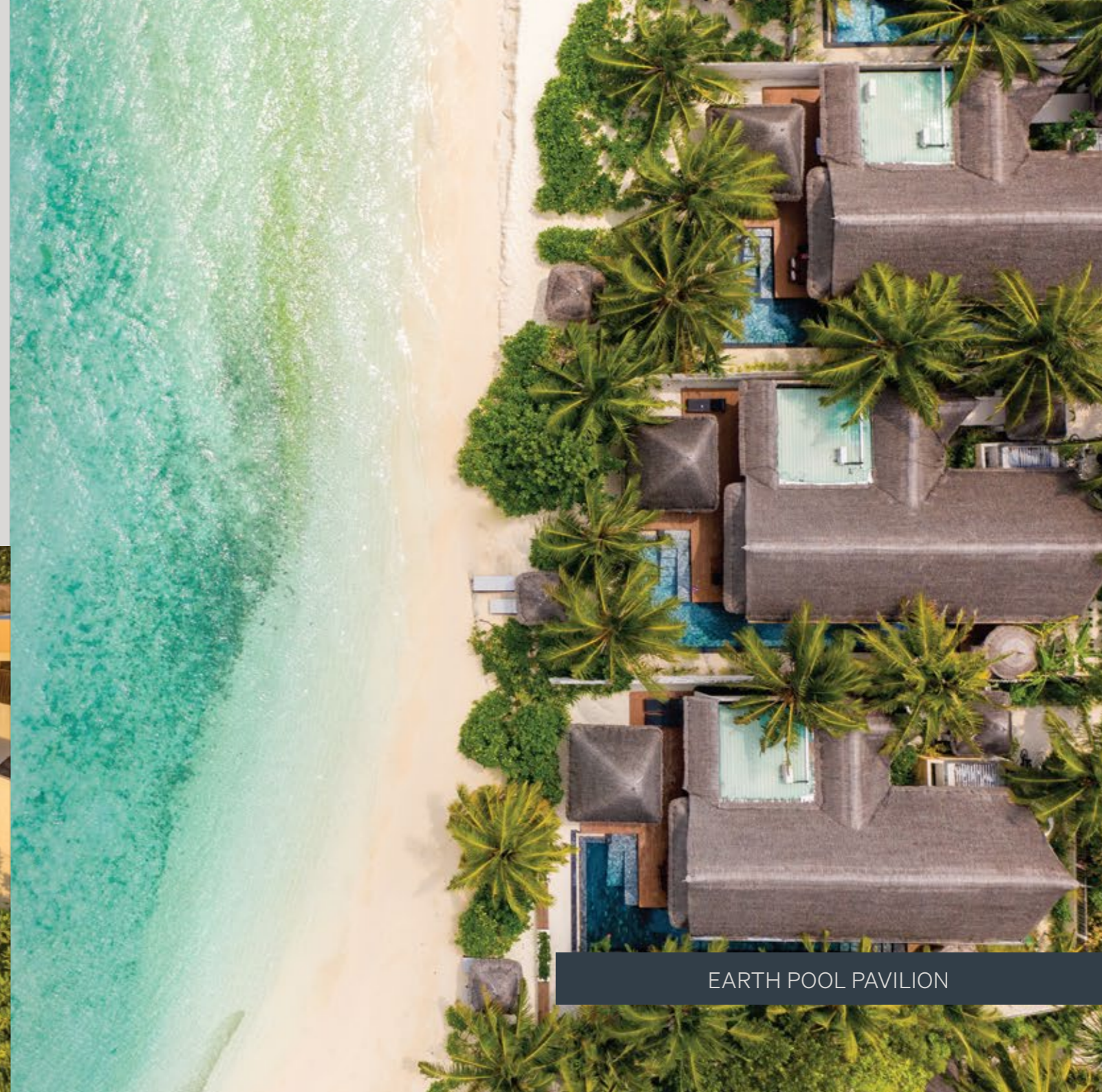
EARTH POOL PAVILION