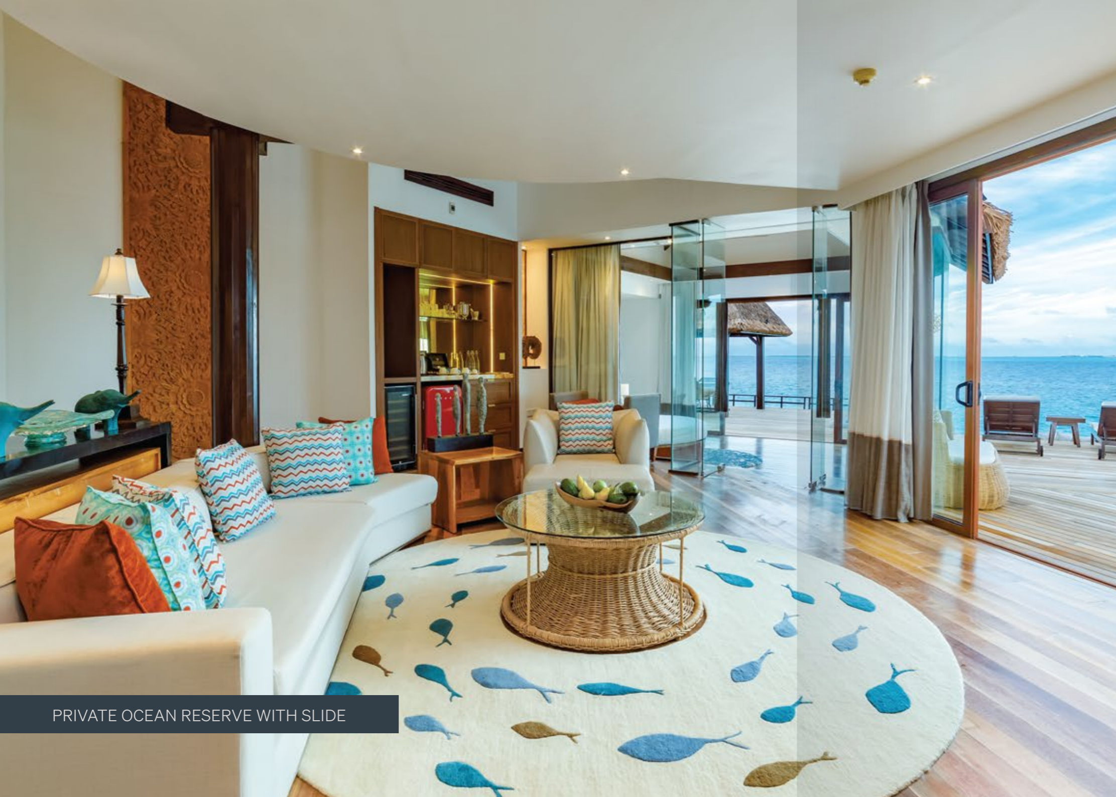
PRIVATE OCEAN RESERVE WITH SLIDE